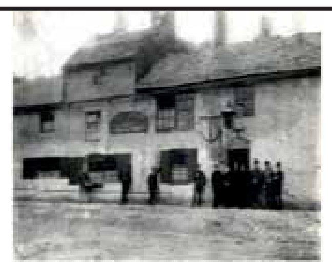
Blue Anchor, Blue Anchor Yard, Market Place, Preston.